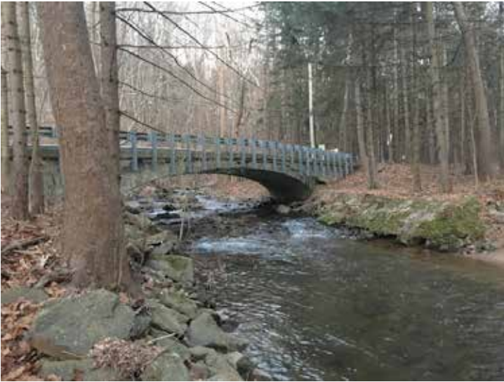
Single span bridge replacement in alluvium.