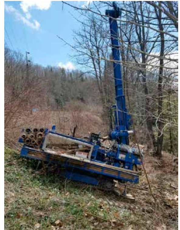
Geotechnical drill rig used for slope stability analysis.